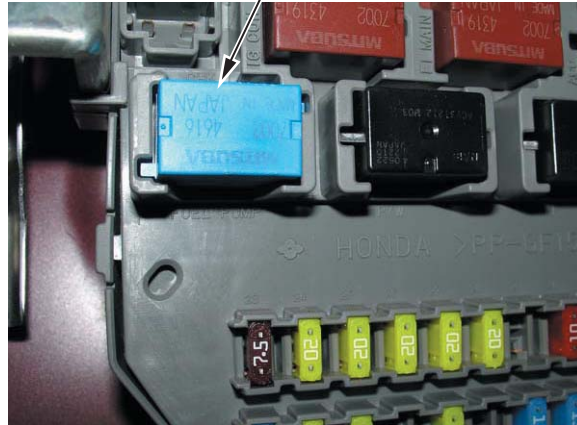
MITSUBA RELAY (Replace it if the vehicle is shown as eligible on a VIN status inquiry.)

NOTE: MITSUBA may be printed upside down.